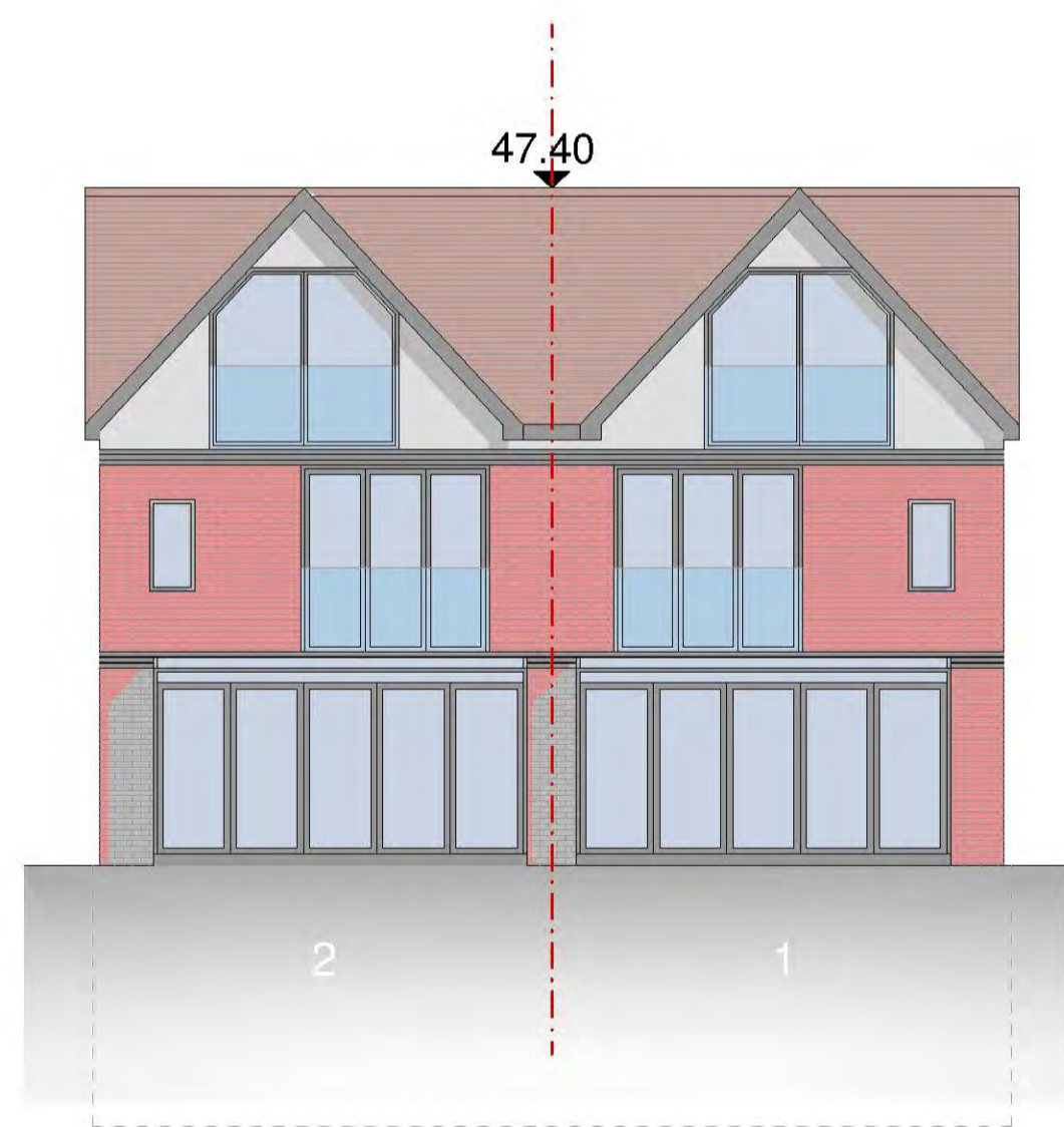
00 Proposed Rear Elevation GA BLOCK A