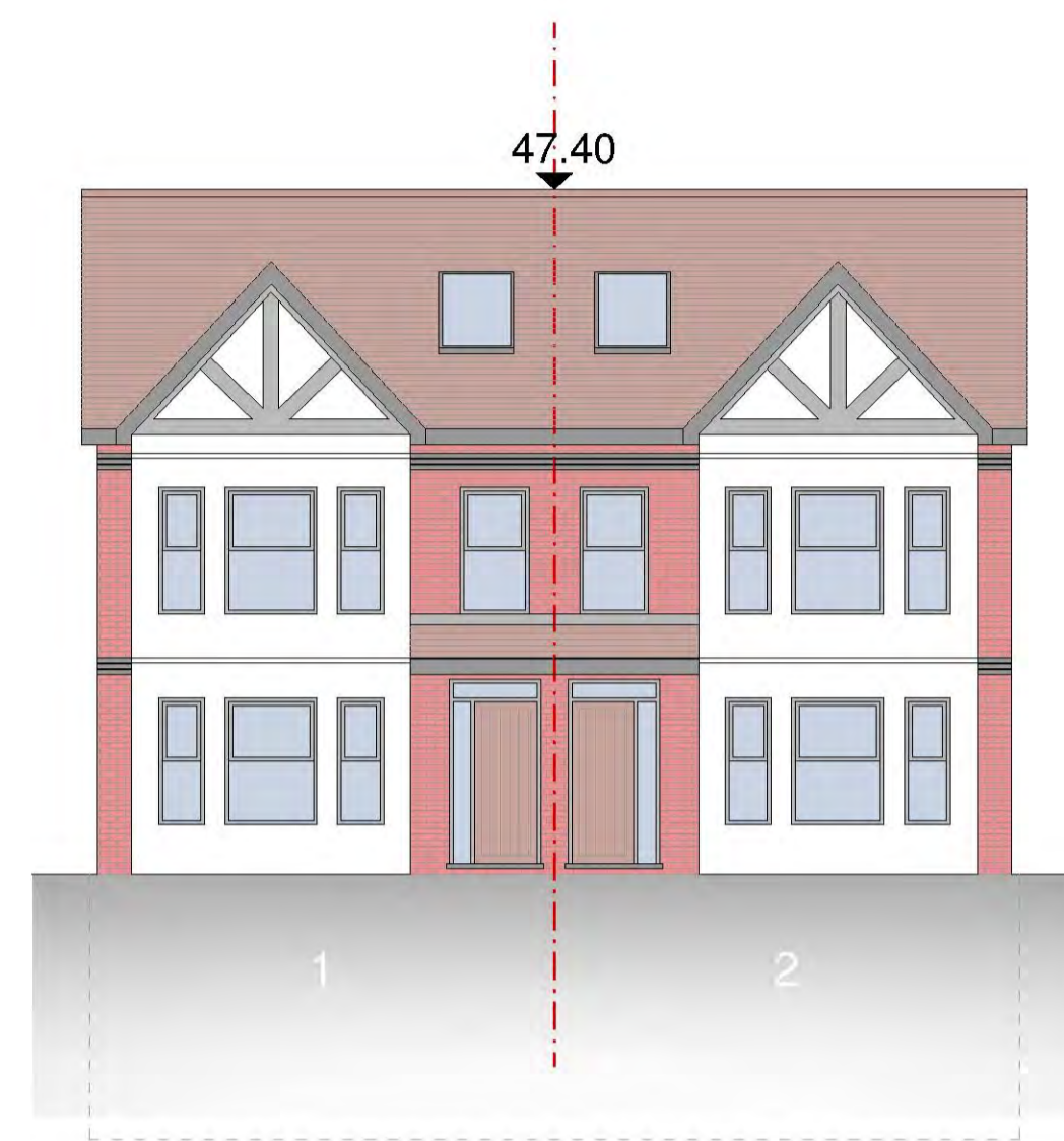
00 Proposed Front Elevation GA BLOCK A

BUILDER INFORMATION: DO NOT BUILD FROM ANY DRAWING PACKAGES THAT DO NOT SAY, BUILDING CONTROL APPROVED, OR IN CONSTRUCTION PACKAGES. IT IS THE RESPONSIBILITY OF THE BUILDER TO CONTACT THE ARCHITECT TO REQUEST CONFIRM THE RIGHT DRAWING PACKAGE IS ON SITE. PLEASE BE ADVISED THAT ALL DRAWING PACKAGES WILL ALSO HAVE STRUCTURAL ENGINEERING WORKS ATTACHED. DO NOT BUILD WITHOUT ALL PAPERWORK. THE CONTRACTOR IS TO ALLOW WITHIN THEIR PRICE FOR ALL ITEMS NOT LISTED BUT THAT WILL BE REQUIRED TO COMPLETE THE WORK IN ACCORDANCE WITH ALL CURRENT LEGISLATION. DRAWING NOTES: ALL ITEMS, NOTES, DIMENSIONS AND GENERAL DESIGN CONTAINED IN THIS DRAWING ARE FOR GUIDANCE PURPOSES ONLY. NOMINATED BUILDER AND PERSON RESPONSIBLE FOR THE PROJECT SHOULD MAKE A THOROUGH CHECK PRIOR TO COMMENCEMENT OF WORKS AGAINST SITE, DRAINAGE SERVICE DRAWINGS, CURRENT BUILDING REGULATIONS, BRITISH STANDARDS AND CODES OF PRACTICE. FAILURE TO DO SO WILL BE AT THE LIABILITY OF THE BUILDER/CONTRACTOR AND NOT THE ARCHITECT. COPYRIGHT THESE DRAWINGS REMAIN THE COPYRIGHT OF BERESFORD & BARNES LTD AND MUST NOT BE USED IN ANY WAY PRIOR WRITTEN CONSENT. IMPORTANT NOTE: NO SIGNED AGREEMENT IS IN PLACE TO ALLOW THE COPYING OF THE WORKS ATTACHED.